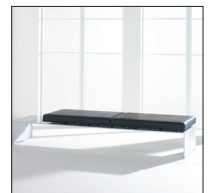
Model #23801 Elevation bench