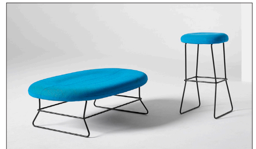
Caravite bench & stool