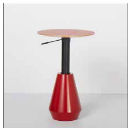
Adjustable Height Tear Drop Table with P-lam top Wilsonart Holly Berry D307-60 & red powder coat base