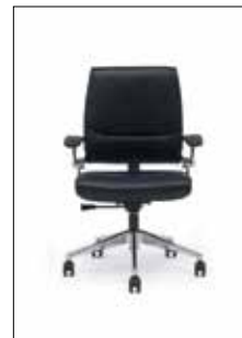
Model # 13305 Medium Back

The ultimate in ergonomic elegance, the AYA™ Chair is based on the principles of natural body motion when reclining. The simplicity of function uses the occupant's own weight to control the seating position. As you recline and stop, the chair will stay in that position. There is no tension control, as the weight of the occupant rides up a ten degree incline, using gravity as the resistance and friction as the position control. There is only one control on the chair which adjusts height and locks the seat in one of five positions.